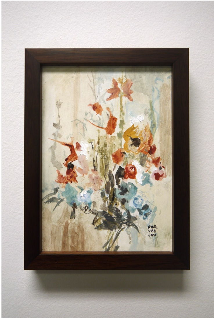
VBB Flowers Oil on wood panel, 5.5 x 7.5", 2016