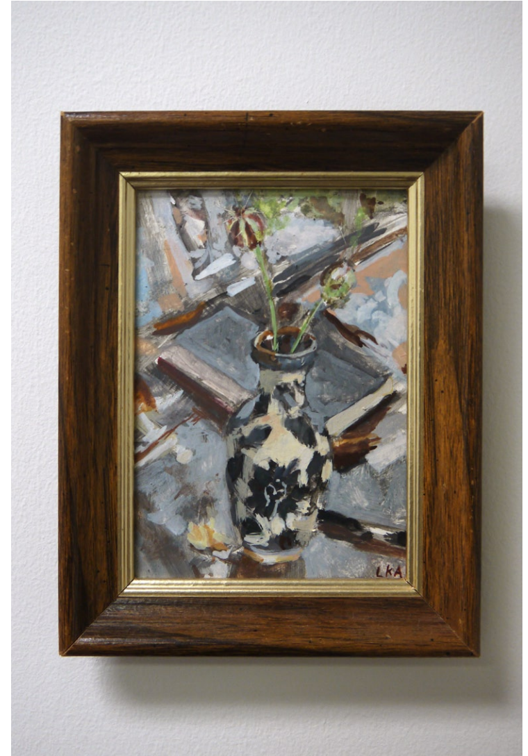
Still Life with Seedpods Egg tempera on wood panel, 5 x 7", 2015