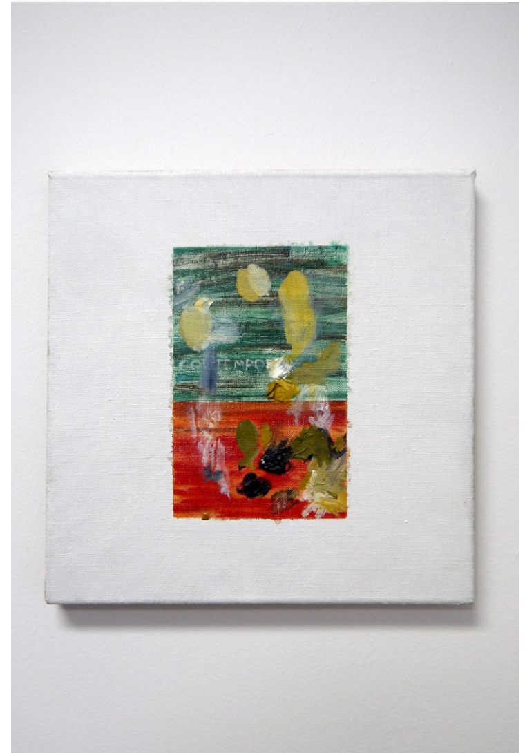
Contemporary Art Oil on linen, 12 x 12", 2014