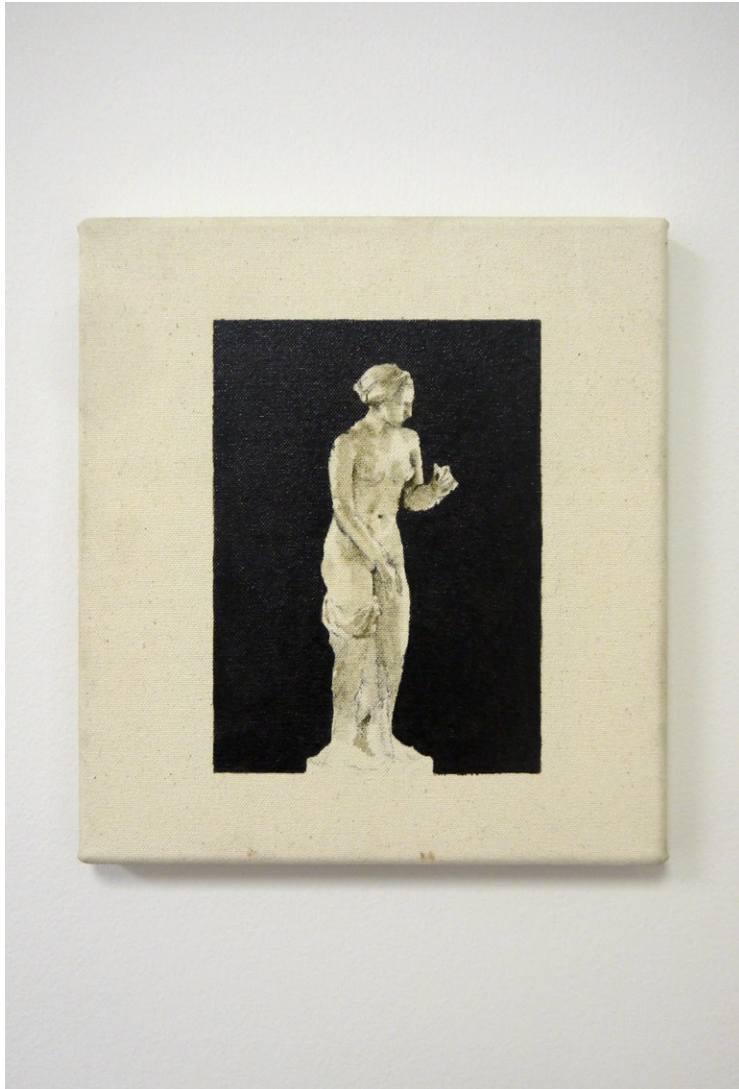
Aphrodite Oil on canvas, 9 x 10", 2013