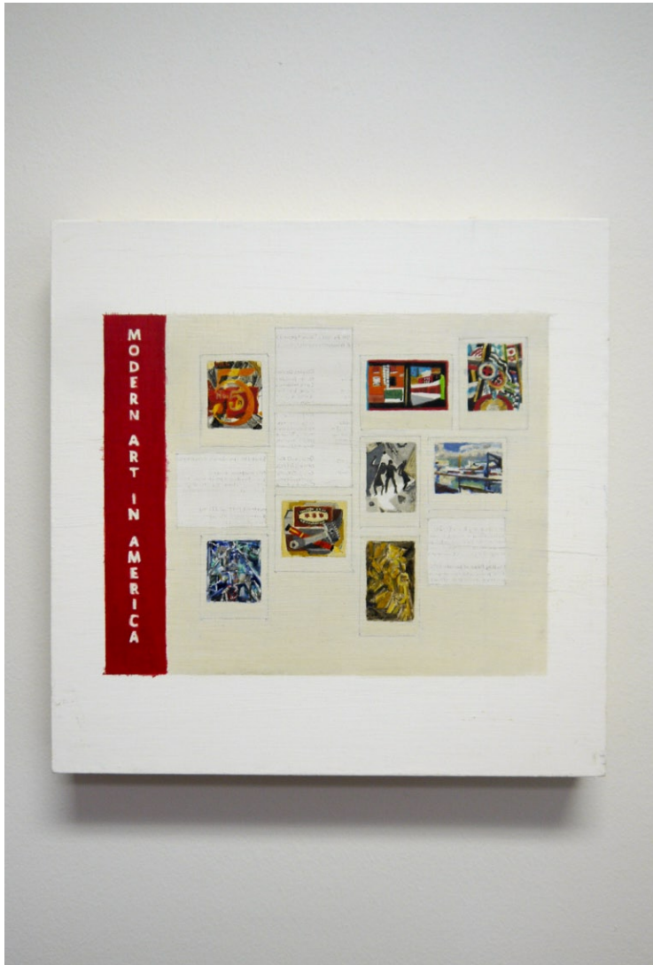
Modern Art Oil on wood panel, 12 x 12", 2014