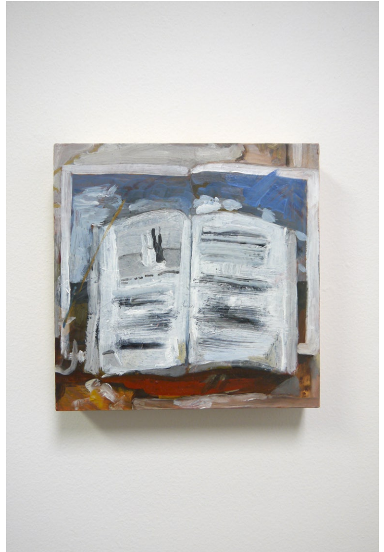
Morandi Book Oil on wood panel, 10 x 10", 2014