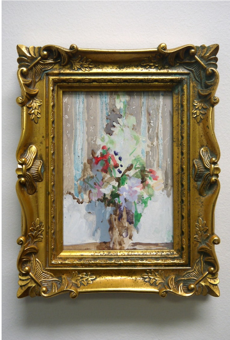
Still Life with Yucca and Trumpet Flower Oil on wood panel, 5 x 7", 2015