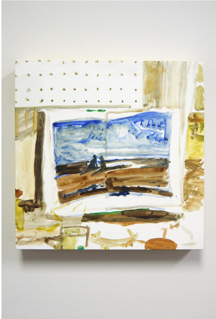
Moonlit Couple on the Beach Oil on wood panel, 12 x 12", 2014